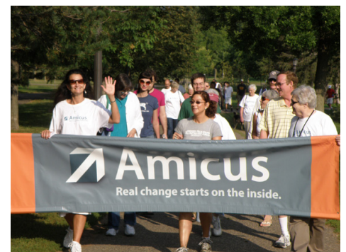
Scene from the first ever Amicus Walk, which took place in September